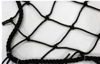
Rope Border Safety Net