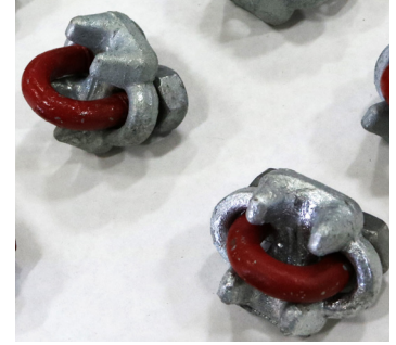
Wire Rope Clips