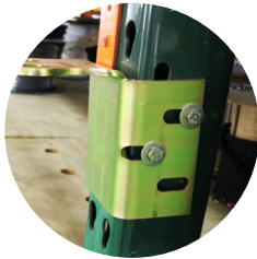
Steps 1 & 2