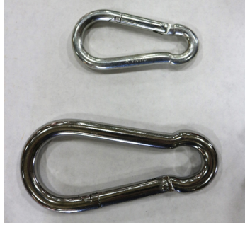
Large & Small Snap Hooks