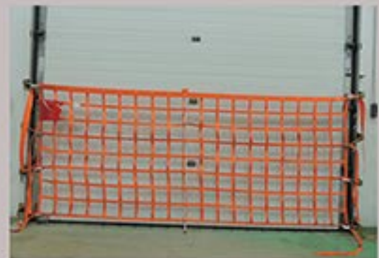
Loading Dock Safety Net Properly Installed