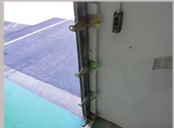
Properly Mounted Brackets