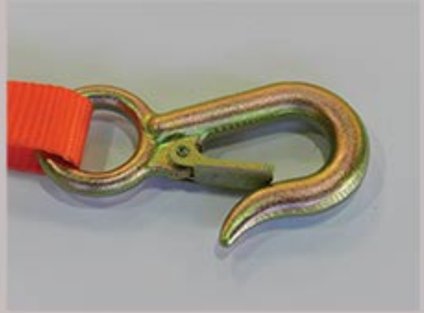
View of fastening Hook